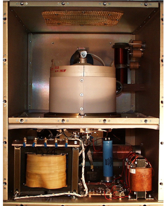
Power Amplifier Compartment

Power Output .....0-80 kW peak pulse Frequency Range: ..... 1.8-2.2 MHz Full Power Bandwidth: greater than 200 KHz Pulse Width: .....0.1-1.2 msec Pulse Repetition Rate: ..... 1-100 Hz Duty Factor: ..... 0.1-8% Pulse Flatness: ..... better than 1% Tube Complement: ..... single 4CX20000 Output Connector: ..... 1 5/8 inch EIA flange RF Load Impedance: ..... 50 Ohms Input Power for 80 kW Peak Pulse: .. 0 dBm Linearity (10-90% of Rated Power): +/- 3 dB Harmonic Distortion: ... better than -30 dBc