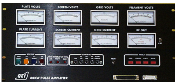
Metering and Control Panel

Years of field proven experience in custom design will assure you of the best possible product, with the most effective interface and monitoring system.